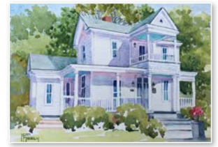
The Turner House