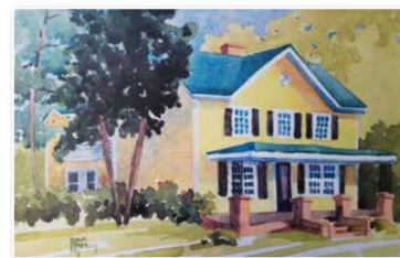
The Morgan House