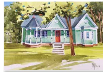
The Hall House